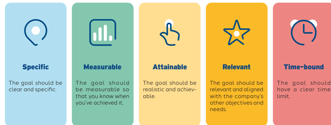
Graph 1. Setting SMART goals. An example of a SMART goal: to reduce the company's energy consumption by 15% over the next 12 months.